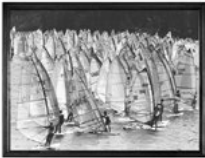
Windsails Panoramic L: 85.2" / 218 cm W: 1.6" / 4 cm H: 65.2" / 167 cm