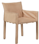
Charlie Chair in Buff