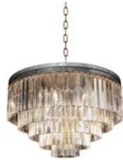
Odeon Medium 5 Ring Pendant

Weight: 105 kg Max. Watt.: 594 / 825 W No. of Bulbs: 33