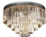
Odeon Medium 5 Ring Flush 80cm

Weight: 31 kg Max. Watt.: 144 / 200 W No. of Bulbs: 8