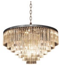
Odeon Large 7 Ring Pendant

L: 43.3" / 110 cm W: 43.3" / 110 cm H: 33.9" / 86 cm