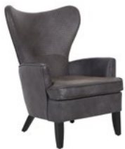
Mentor in Destroyed Black