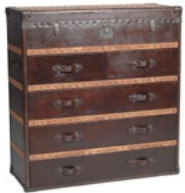
Ampleforth Large Chest L: 47.2" / 120 cm W: 19.7" / 50 cm H: 49.8" / 126.5 cm