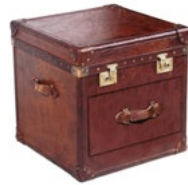
Ampleforth Large Side Table L: 23.2" / 59 cm W: 23.2" / 59 cm H: 23.4" / 59.5 cm