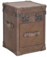
Ampleforth Small Side Table L: 16.1" / 41 cm W: 16.3" / 41.5 cm H: 22.2" / 56.5 cm