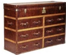
Ampleforth Sideboard L: 59.1" / 150 cm W: 19.7" / 50 cm H: 40.2" / 102 cm