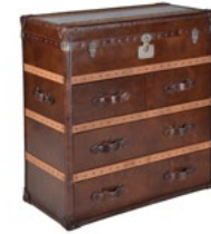
Ampleforth Medium Chest L: 39.4" / 100 cm W: 19.7" / 50 cm H: 40.2" / 102 cm