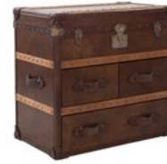
Ampleforth Small Chest L: 31.5" / 80 cm W: 19.7" / 50 cm H: 30.5" / 77.5 cm